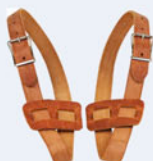
Pack Animal Ready with hanging strap