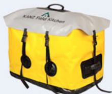
Water Proof with dry-bag

Polyurethane clear coat on wood panels inside and outside (outside color ABS laminate optional)