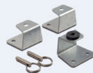
Wall Mountable with wall mount kit