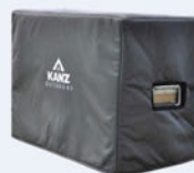
Protected with padded cover